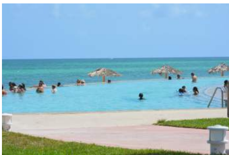
What a view at the infinity pool!

On Sunday many guests joined MMYC on our snorkeling/beach party excursion to Peterson Cay, one of Grand Bahamas beautiful national island parks. Other guests enjoyed the infinity pool overlooking the ocean at the resort, the spa, fishing, or shopping!