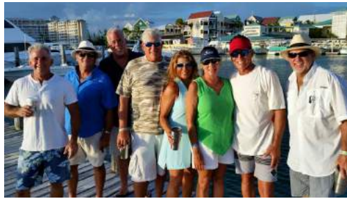
Dock party Sunday evening!

MMYC guests finished the weekend on Sunday evening with a good ol' fashion dock party with tall drinks and taller tales shared by all!