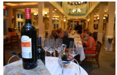
MMYC sponsored 4 star dinner at Churchills